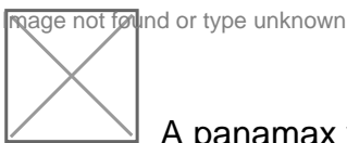
A panamax vessel discharging animal feed at Royal Portbury Dock

Bristol Port is experienced in the handling of dry bulk cargoes with an ability to handle vessels up to 130,000 dwt through our two dry bulk terminals at Royal Portbury Dock and Avonmouth Dock